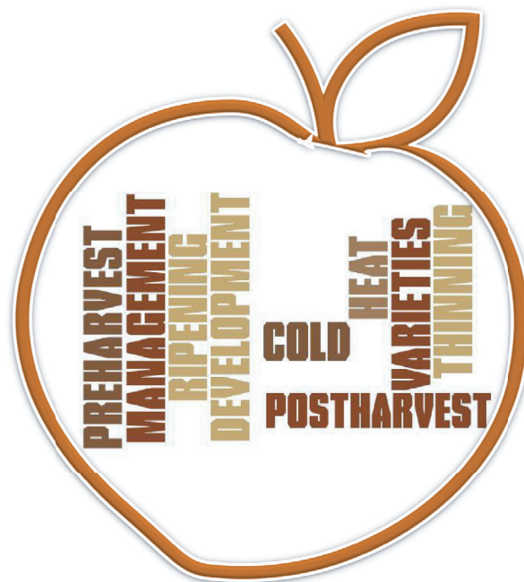
Fig. 2. The main sources of metabolomic diversity and conditions that induce metabolic reconfigurations in peach fruit, as discussed in the present review.

The development and ripening of fruits are dynamic processes that comprise complex molecular and biochemical changes, which are linked to great metabolome modifications. Peach development is divided into well distinct stages (S1 to S4) [35]. The first stage after fruit set (S1), characterized by a rapid increase in cell division and elongation, is followed by the second stage (S2), which is characterized by endocarp lignification to form the stone, with practically no increase in fruit size. During the third stage (S3), a rapid increase in fruit size takes place concomitant with rapid cell division, while in the final stage (S4), the peach fruit reaches the final full size. Nontargeted metabolomic studies during development of a particular peach variety have shown that each stage of development is characterized by specific metabolic programs [36]. Moreover, differential biochemical processes take place in distinct tissues during early