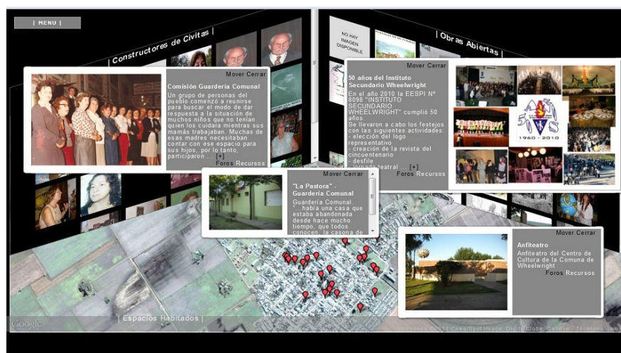
Figure 2. "Book of Plural Memory"

However, the same construction gives those who experience it, brief moments of certainty or horizons to where navigate.